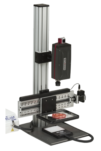
Backlighting with a clear stage platform. Often used to scan biological samples.