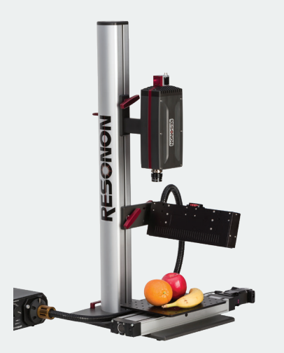
The linear stage holds the sample and translates across the field of view. Used for small samples that are easy to move.